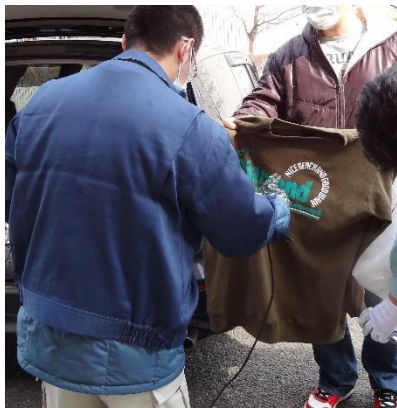
Measurement of radiation exposure