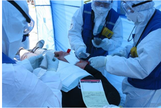
2013 KIRAMS (Korea)