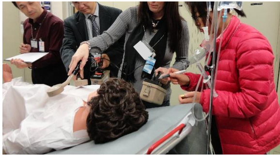
2012 REAC/TS (US)